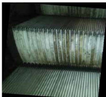
Escalator steps before cleaning

Our cleaning equipment eliminates the time, labor and cost to physically take the steps out of the escalator for power washing elsewhere on your property. And, if timing is a concern, an average escalator takes 6 – 7 hours the first time it is cleaned. We can perform this cleaning after hours. While step cleaning cannot produce the same results as step replacement, the process does produce a noticeable improvement to your escalator's overall appearance.