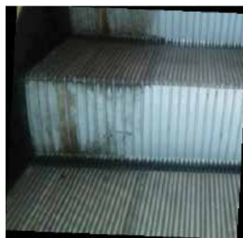
Escalator steps cleaning in progress