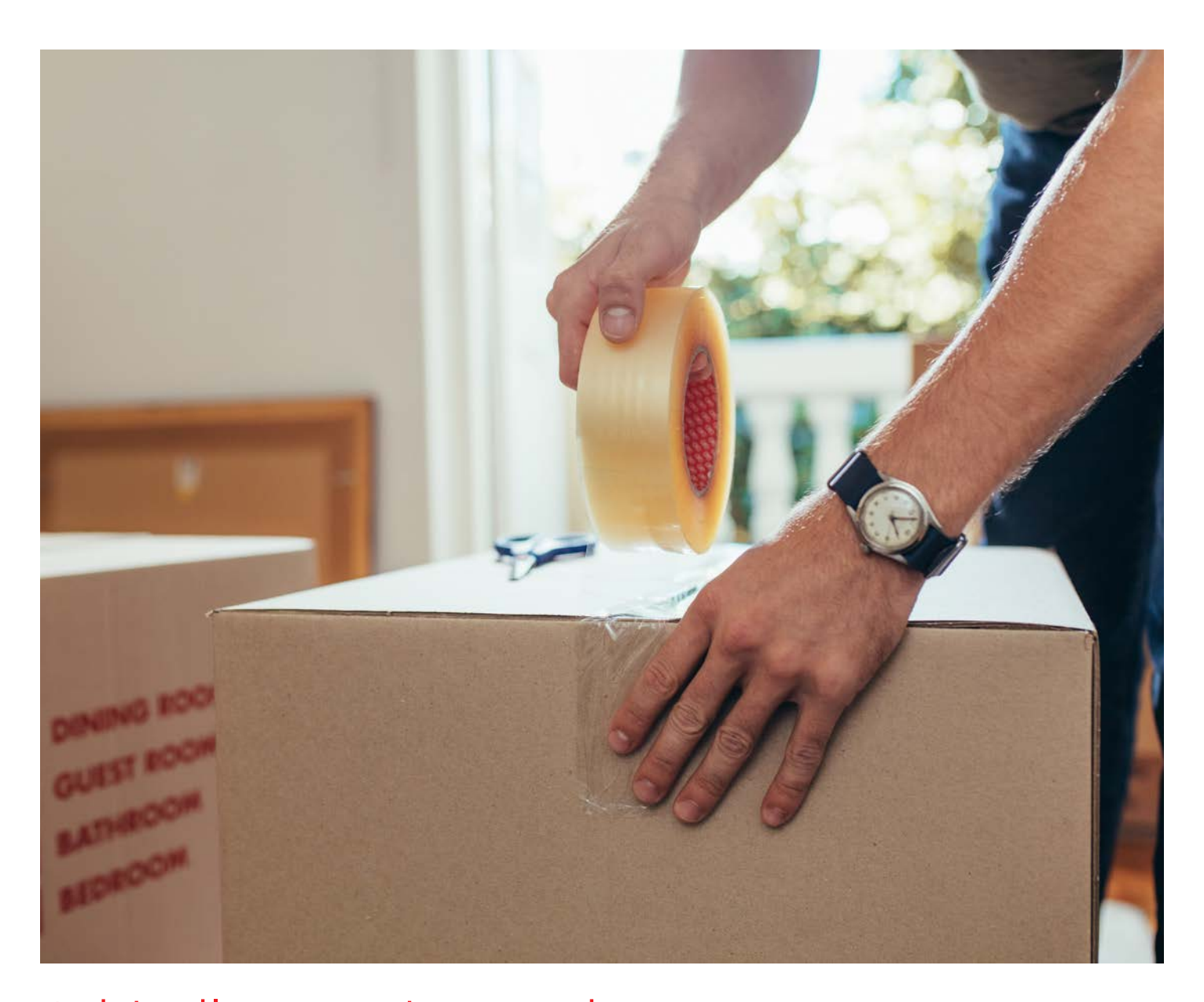
Schindler Moving Package Making moving easier for you and your tenants